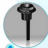
TFT - Thermal Freshness Tracker