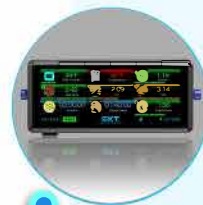
SKT - Smart Kitchen Timer