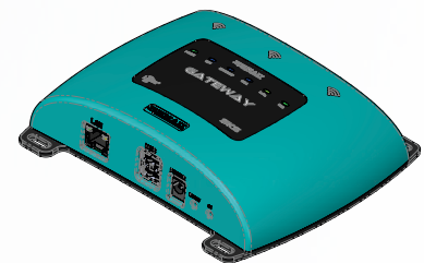
REFERENCE VIEW ONLY